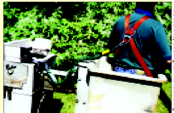
A fall-arrest system.