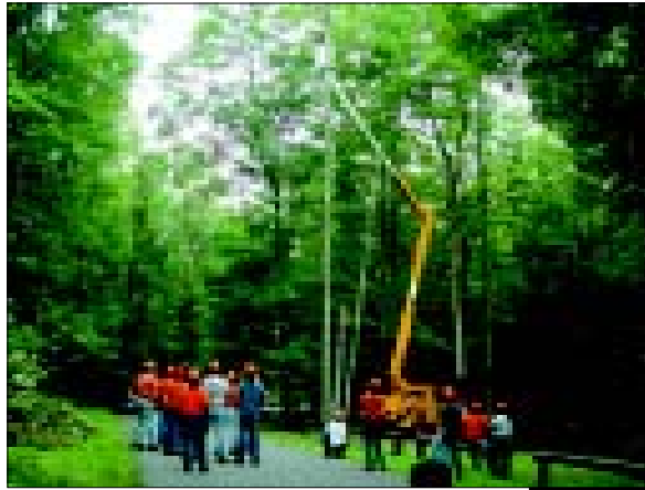
Rigging for Removal class.

Sometimes we have to step off of the treadmill hustle and bustle to see the big picture. If we truly want to attract and keep responsible, productive people – and gain the respect of the general public for the truly important and valuable work that we