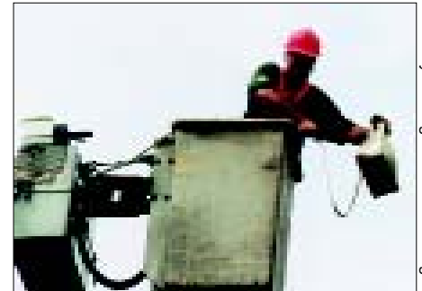
Deploying a bucket evacuation system.

Along with a huge growth in the number of Spanish speaking workers in the tree care industry, there has been a large increase in the number of injuries and deaths among the non-English speaking workforce. Manuals, fact sheets, procedural information, warning decals etc. should be provided in Spanish and English. Check with manufacturers for help with Spanish manuals and warning decals. Also, Check with the Tree Care Industry Association about their broad array of Spanish-language training products at www.treecareindustry.org/content/buysell/prodsandsvcs.htm .