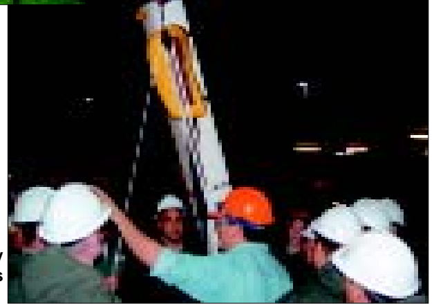
Emergency Preparedness Training.

do – then it's up to each of us to develop and build our industry and our respective companies from the ground up.